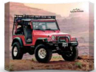
Curved Presto Frame PFK43C, GF43BC graphic with end panels.