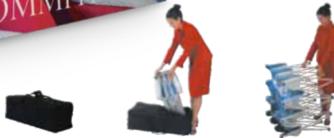
Travel Bag included with every unit.

Note: Each quad is approximately 30" x 30".