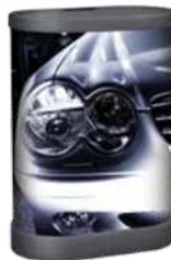
OPC1 & GFW1