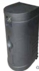
OPC2 (2 shown)