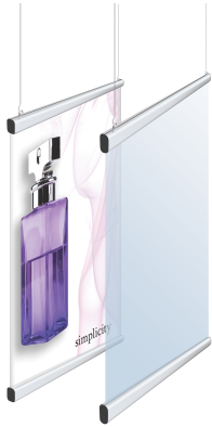
SnapGraphic™ Grippers, Oval, Long Case

INGENIOUS GRIPPER SNAPS CLOSED AFTER GRAPHIC INSERTION