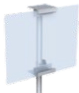
Metal Sign Brackets

Holds placards and signs up to 3/4 thick Single or double sided